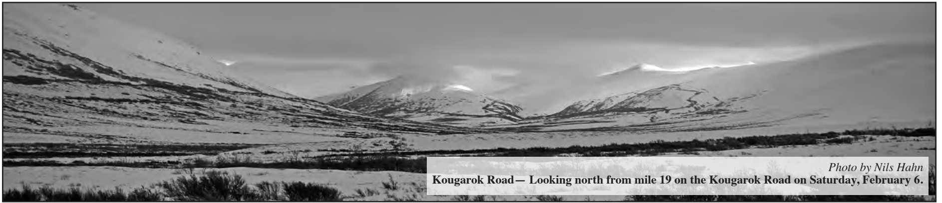
Kougarok Road— Looking north from mile 19 on the Kougarok Road on Saturday, February 6.