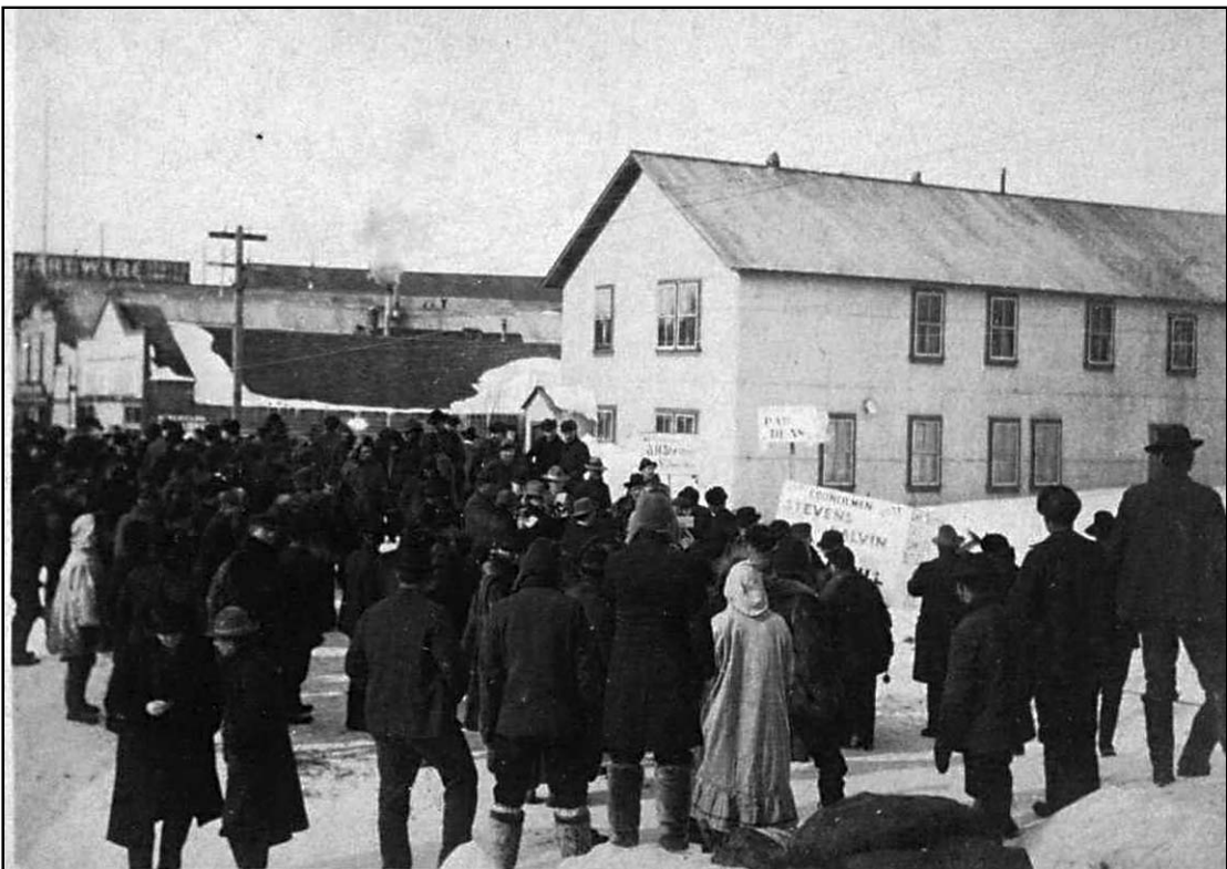
Comment & Photo Courtesy of the Carrie M. McLain Memorial Museum OF THE PEOPLE, BY THE PEOPLE, FOR THE PEOPLE – Nome residents turned out in droves for the 1903 election day balloting in Nome, Alaska.